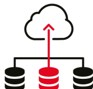
Cloud Backup & Archives