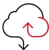
Backup & Recovery

Unitrends is trusted by business visionaries, IT leaders and Pro's who know that in today's digital world protecting their ideas and keeping their business running is non-negotiable. Unitrends' portfolio of all-in-one cloud-empowered backup and continuity solutions deliver unmatched flexibility as your needs evolve and assure that you can recover virtual, physical, and cloud-based data, systems, and applications with 100 percent confidence.